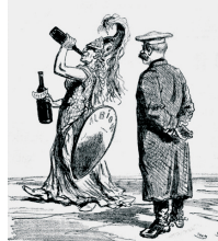
Read a painting //