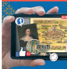
Creative Action //