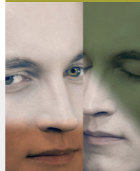
In Parallel_2 out of 5 //