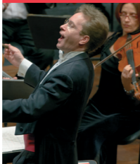
Musical Titans //